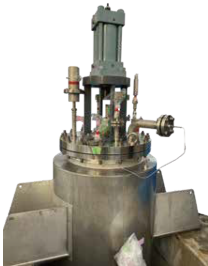
Liquid hydrogen test in progress