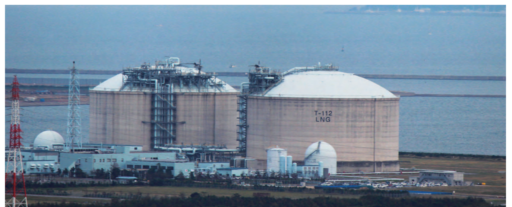
Liquid Hydrogen Receiving Terminal