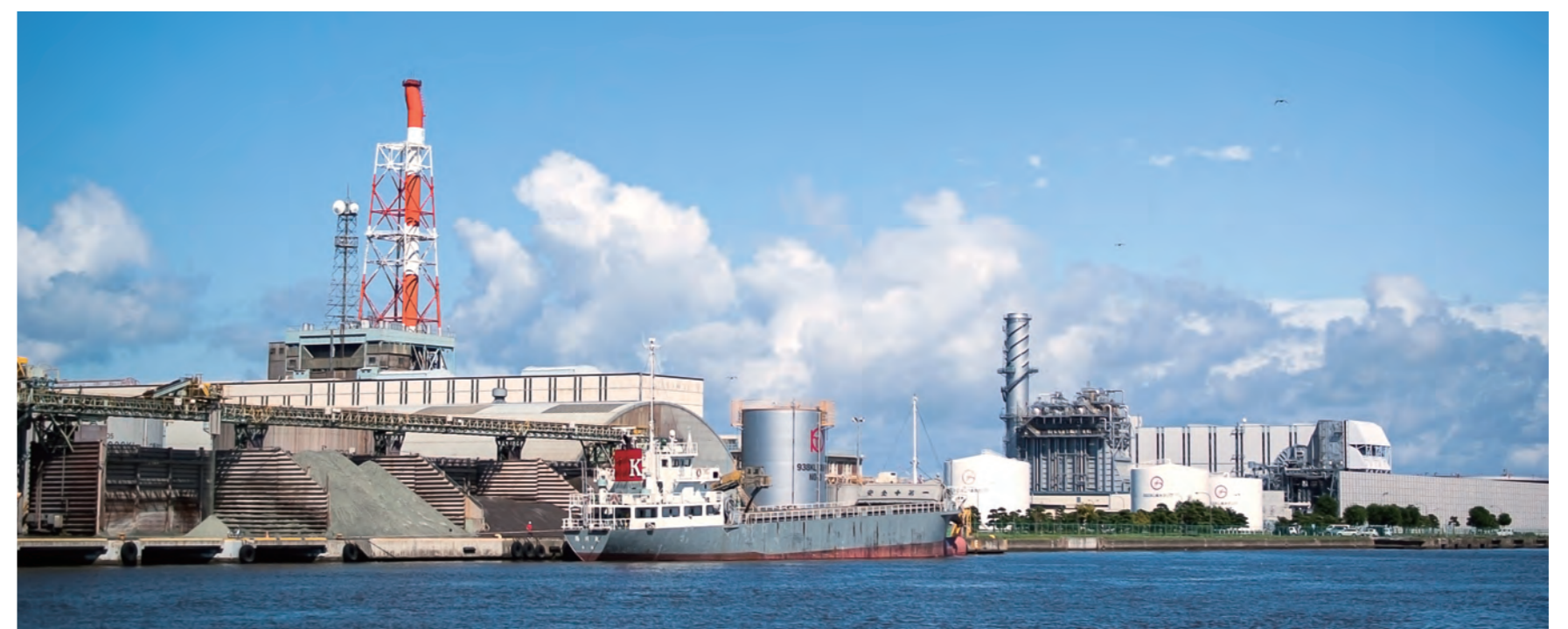
Transporting Liquid Hydrogen