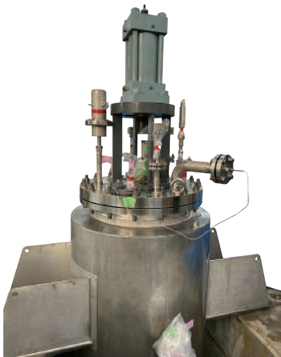
Image of Liquid Hydrogen Testing